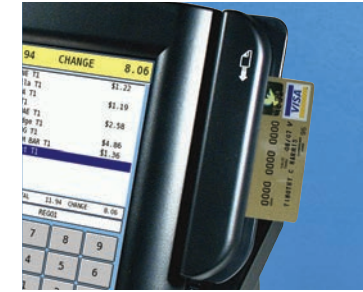
Magnetic Card Reader Use to swipe payment cards when integrated payment options are implemented, or to log or clock in employees.