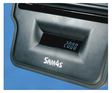
Rear Display The rear display allows consumers to monitor prices as items are entered and view the sale total.