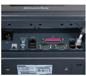
Easy to Access Ports Connect to a wide array of compatible off-the-shelf POS peripherals with six serial ports and two USB ports.