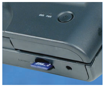
Easy Save/Load Store programs or collect reports with the SD memory card port or USB port.